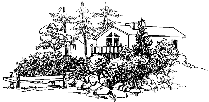
Illustration credit: University of Wisconsin-Extension and the Wisconsin Department of Natural Resources